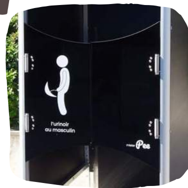
Hinged doors for more privacy