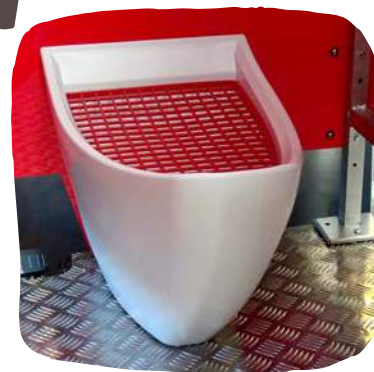
Patented bowl ergonomic and with a grid